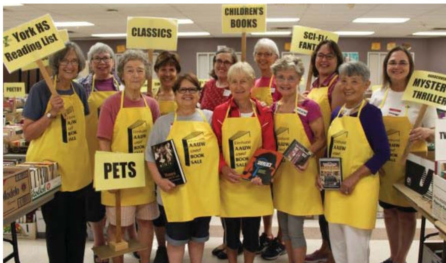
It won't be long! Get ready for the 2021 AAUW Used Book Sale. See details on p.5.